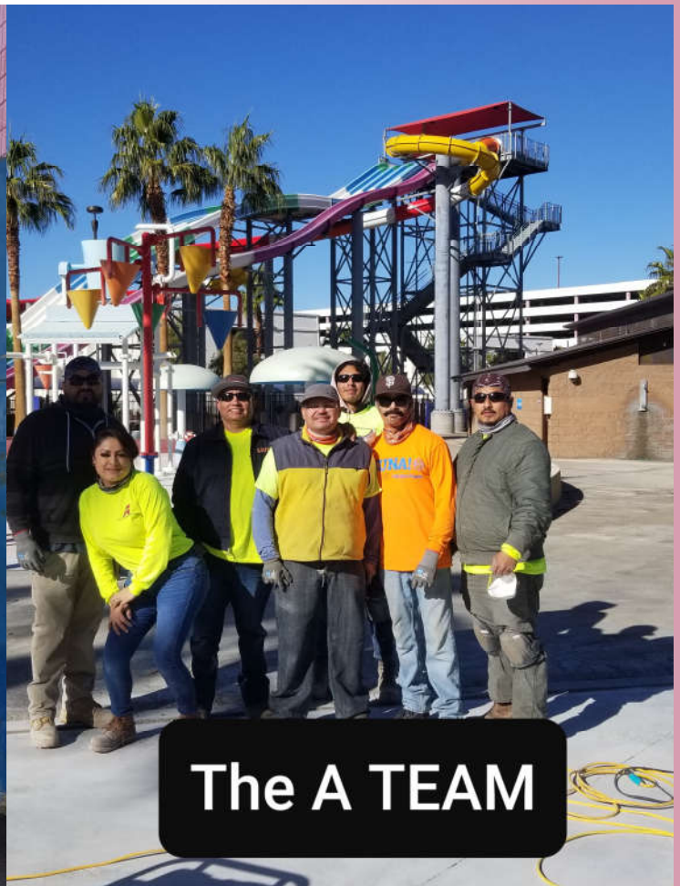
The A TEAM